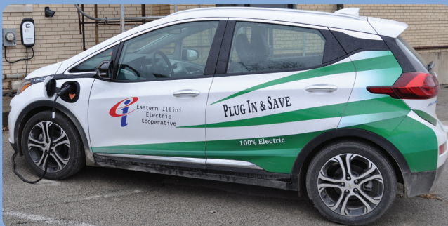
Chevy Bolt EV