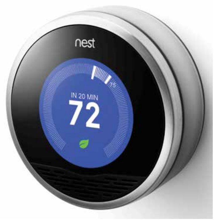
Programmable "smart" thermostats like the nest can help you manage your heating and cooling system from anywhere.

If you are interested in purchasing other appliances